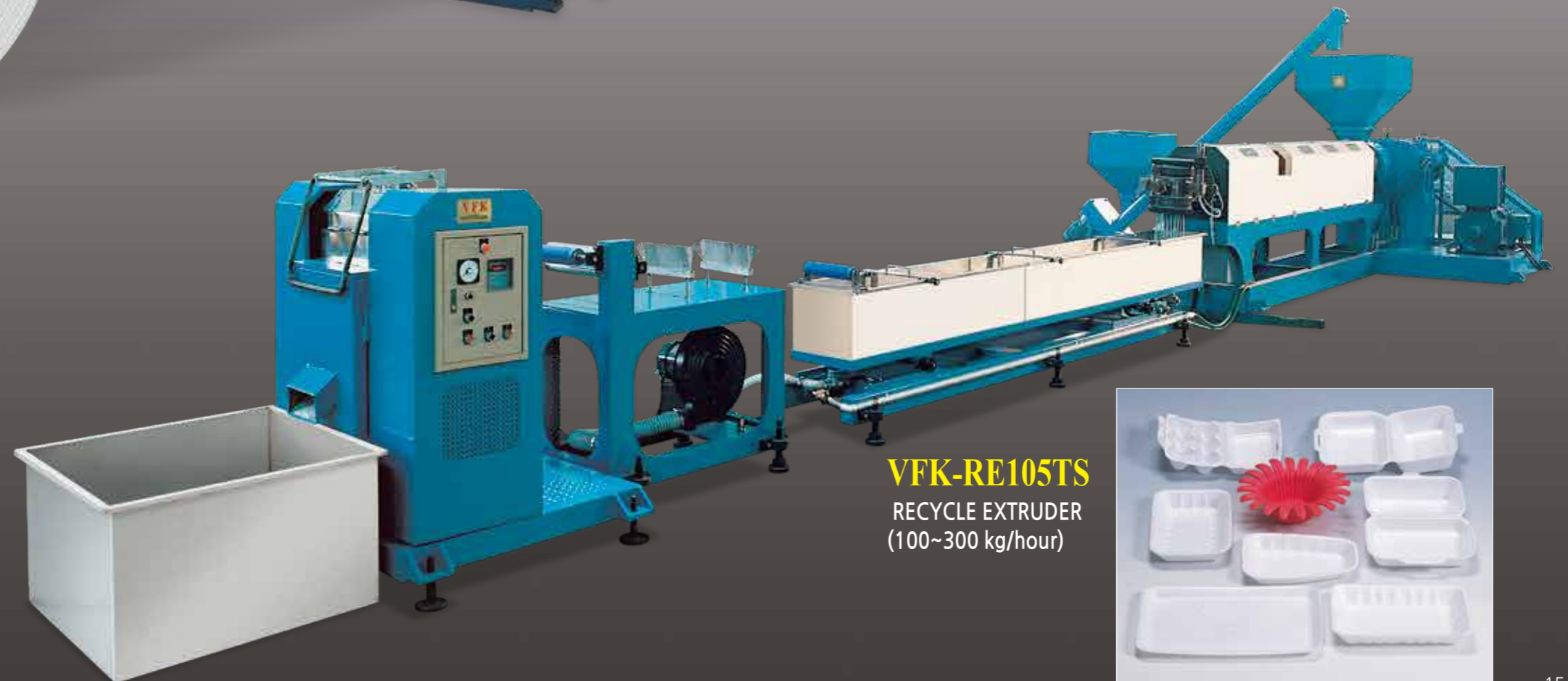
VFK-RE105TS RECYCLE EXTRUDER (100~300 kg/hour)