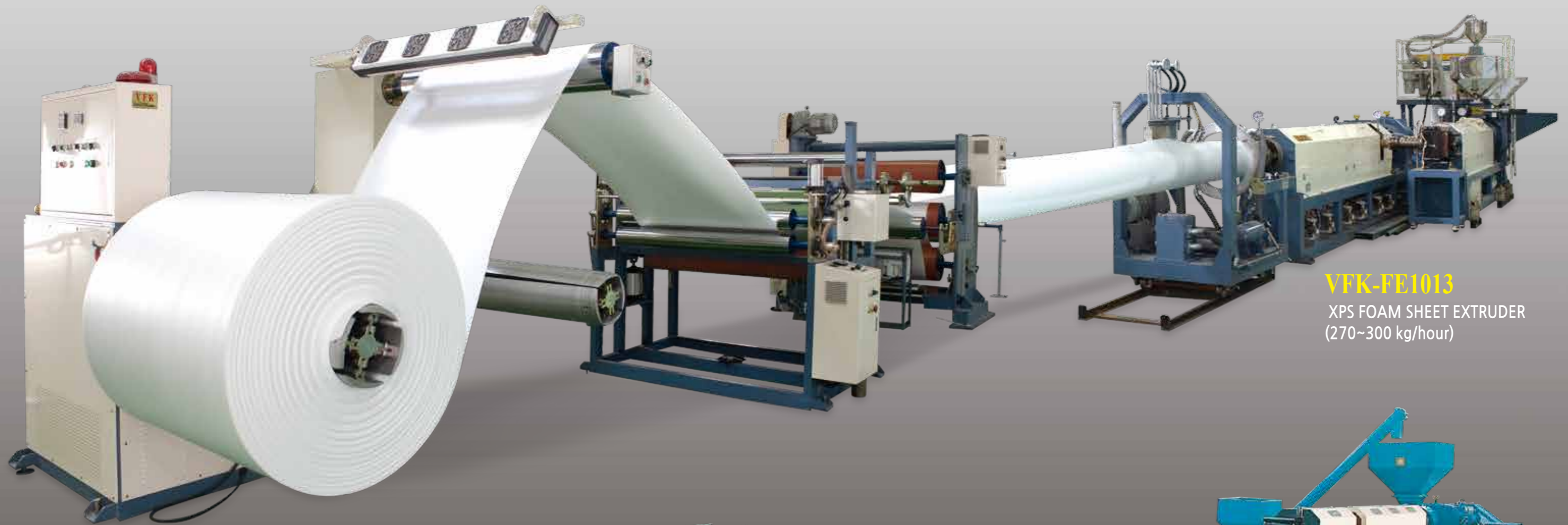
VFK-FE1013 XPS FOAM SHEET EXTRUDER (270~300 kg/hour)