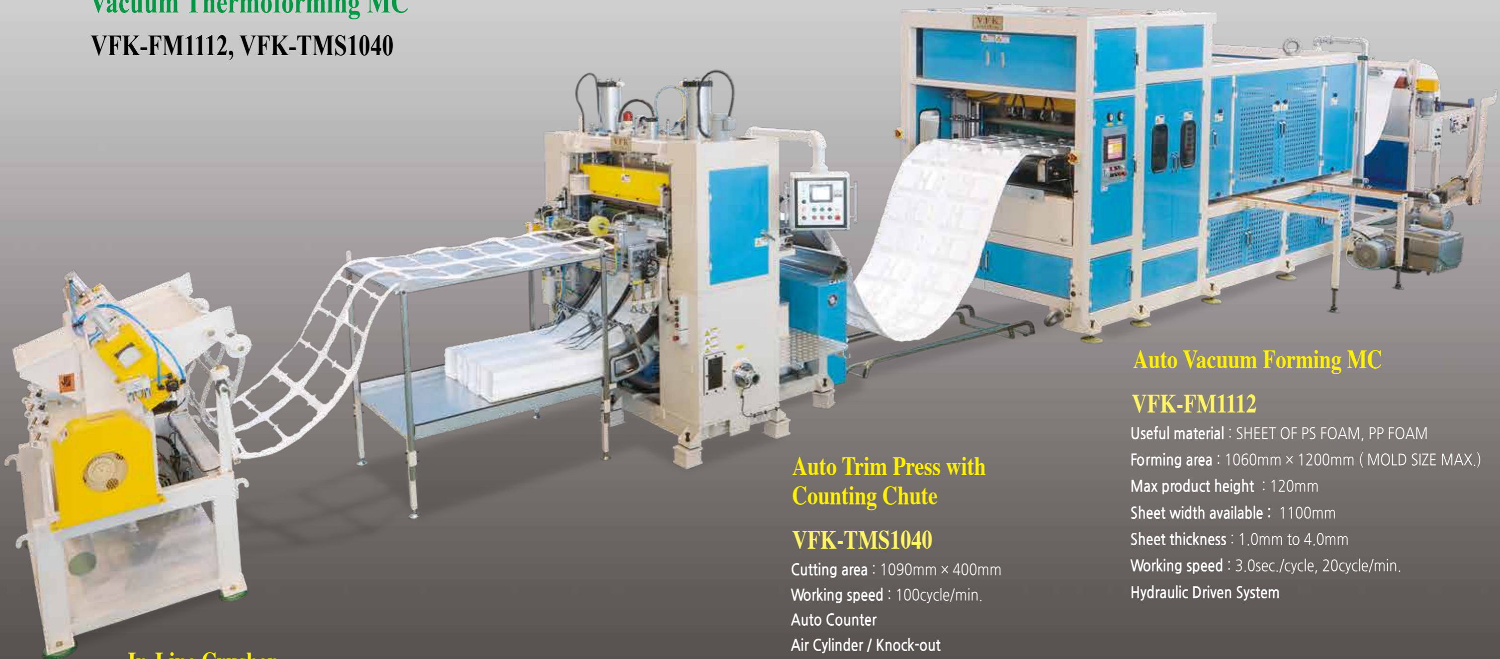
In-Line Crusher VFK-CR1100